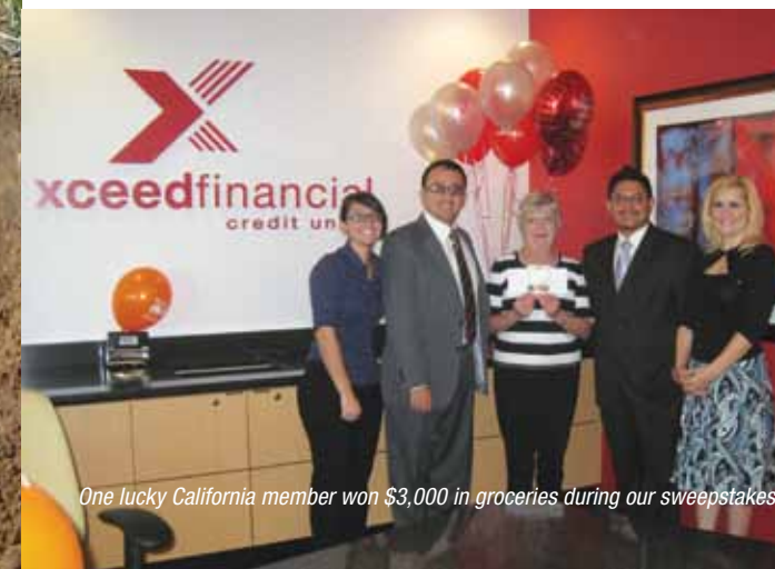
One lucky California member won $3,000 in groceries during our sweepstakes.

To help our members stand up to last year's challenging economy, we held a number of seminars at Financial Centers throughout the year. Members from across the country attended workshops with topics like: Building a Better Budget, College Financing, Teens and Money, First-time Homebuyer, and Breezing through the Holidays. We even made some of our more popular topics available online as webinars.