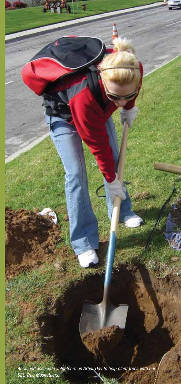
An Xceed associate volunteers on Arbor Day to help plant trees with our SEG Tree Musketeers.

Our associates asked for it, and we're so glad they did. We now have a recycling program to continue our commitment to making Xceed a greener organization. We also went eco with our beverages, handing out Xceed hot beverage mugs and stainless steel water bottles to our entire team. To encourage our members to go green, we offered them the opportunity to win one of five iPhones when they signed up for eStatements. We even partnered with OfficeMax, one of our largest SEGs, to learn more about eco-friendly products that will help us become even greener at work and at home.